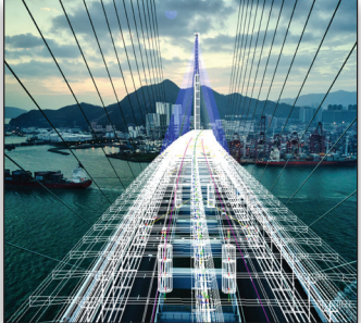
Create intelligent 3D parametric bridge models – digital twins of a bridge

a rich data asset for as-built documentation, maintenance, and operations. Because of its collaboration and data management, OpenBridge Designer is the ideal solution for professional bridge organizations, construction teams, maintenance and inspection crews, and bridge owner-operators.