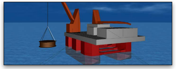
MOSES can compute motions and stability of any vessel or platform.

All three packages include the MOSES Solver and MOSES Language modules – the platform on which all analysis capabilities depend. The unique, generalized solver allows the consideration of all types of forces acting on the floating system, including hydrostatic, hydrodynamic, inertial,